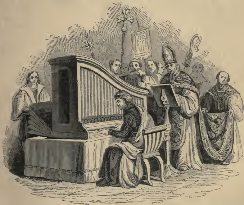
BISHOP OF PAMIRS singing the Mass at the Festival of St. Nicholas, held by the Count de Foix. The Organ drawn from Harl. MS. 3469, and the Costume from a MS. Froissart of Fifteenth Century.

and has a most magnificent court, as I myself noticed, being present on that day. The whole clergy of the town of Orthès, with all its inhabitants, walk in procession to seek the count at the castle, who on foot returns with them to the church of St. Nicholas, where is sung the psalm " Benedictus Dominus, Deus meus, qui docet manus meas ad prælium, et digitos meos ad bellum, " from the Psalter of David, which, when finished, recommences, as is done in the chapels of the pope or king of France, on Christmas or Easter days, for there were plenty of choristers. The bishop of Pamiers sang the mass for the day; and I there heard organs play as melodiously as I have ever heard in any place. To speak briefly and truly, the count de Foix was perfect in person and in mind; and no contemporary prince could be compared with him for sense, honour, or liberality. At the feasts of Christmas, which he kept with great solemnity, crowds of knights and squires from Gascony waited on him, to all of whom he gave splendid entertainments. I saw there the bourg d'Espaign , of whose surprising strength sir Espaign du Lyon had told me, which made me more desirous to see him, and the count showed him many civilities. I saw also knights from Arragon and England; which last were of the household of the duke of Lancaster, who at that time resided at Bordeaux, whom the count received very graciously, and presented with handsome gifts.